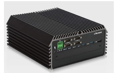
PixAlarm - Pixen

Thanks to its graphical scripting engine, PixAlarm performs various actions according to your use cases and needs.